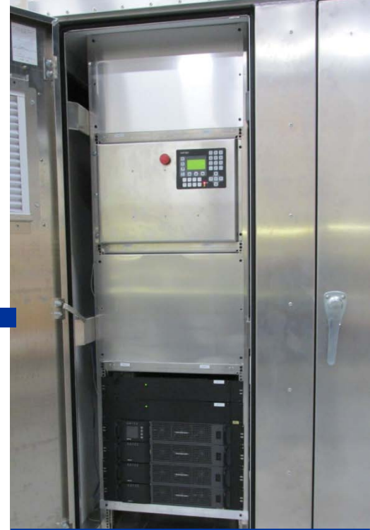
4-Door Fuel Cell & Fuel Cabinet

NEW, Fast-Deploy cabinet option, NO concrete pad needed!